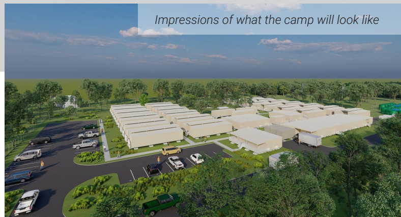
Impressions of what the camp will look like